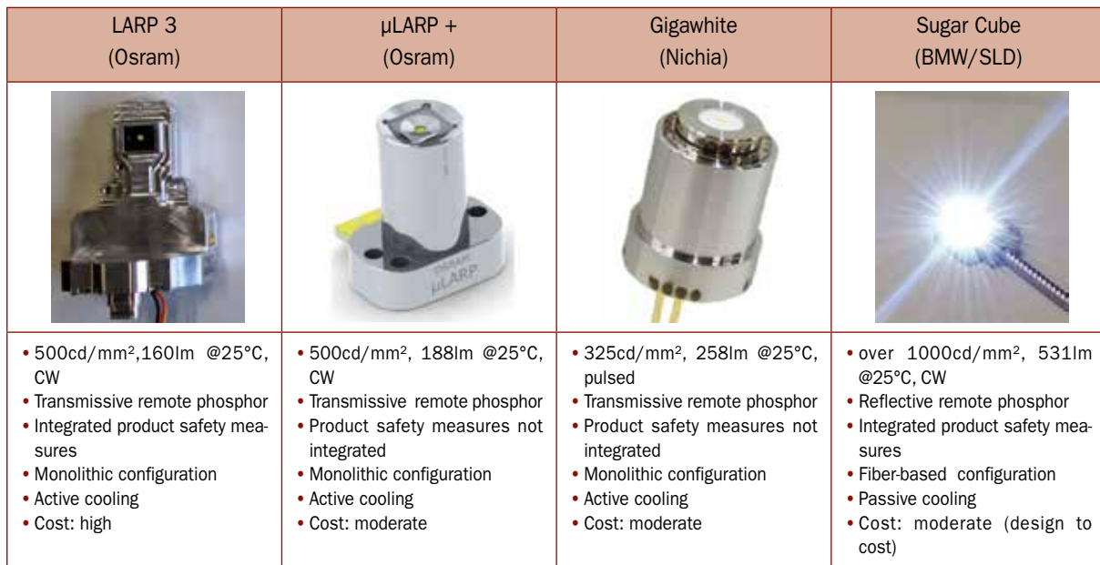
Table 1: Different laser-based white light engines