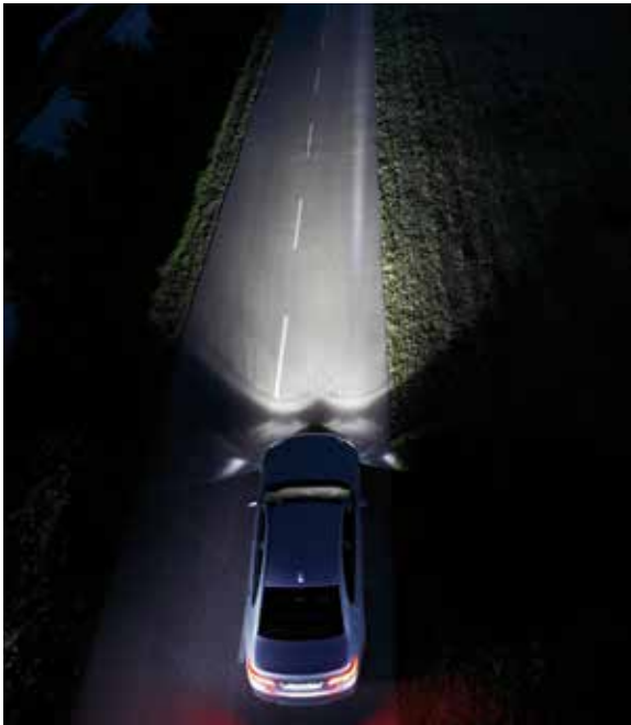
Picture 3: Marking lighting to assist drivers to detect not only pedestrians but also animals (e.g. deer) at an adequate distance